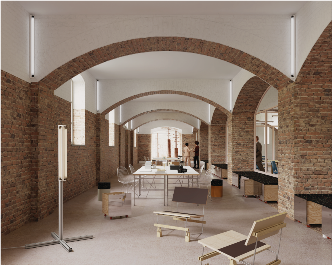
Pagliere 01 – Ground floor – Offices & Workshops

Each time transversal perspective on the Ala Mosca and Pagliere depicting the atmosphere and details of the spaces.