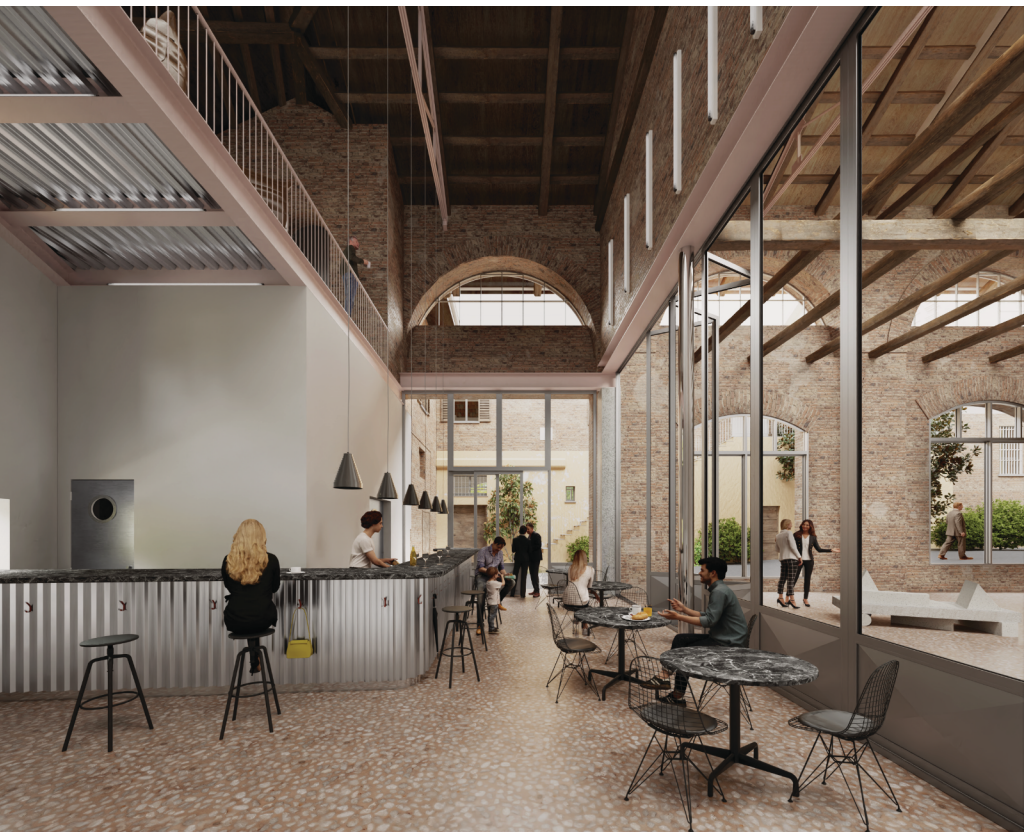
Pagliere 02 – Café via Rossini