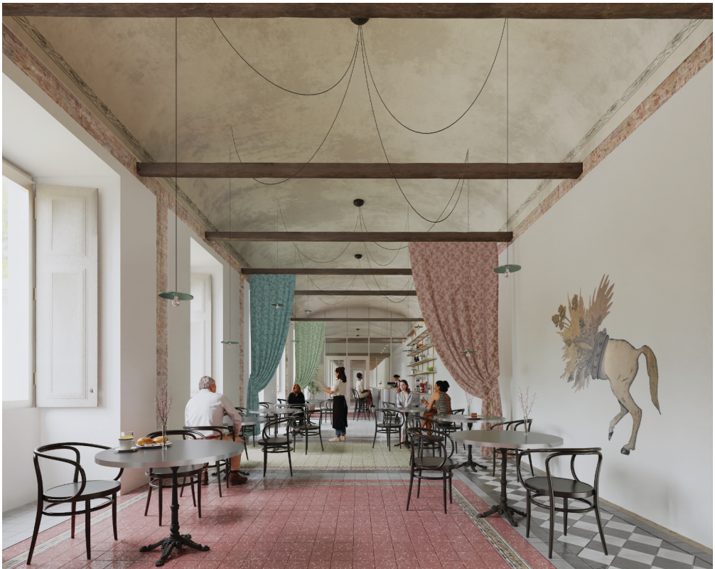
02 – Mezzanine floor – Café