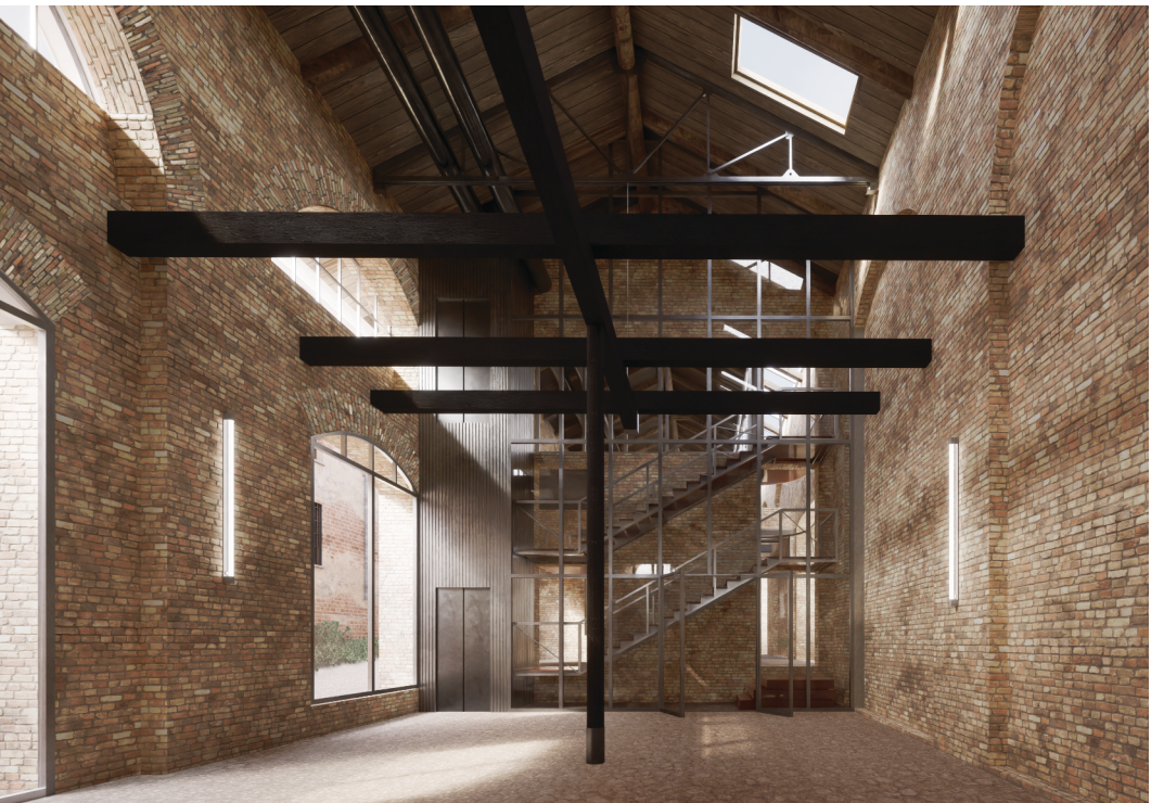
Pagliere 03 – Gallery / Free space