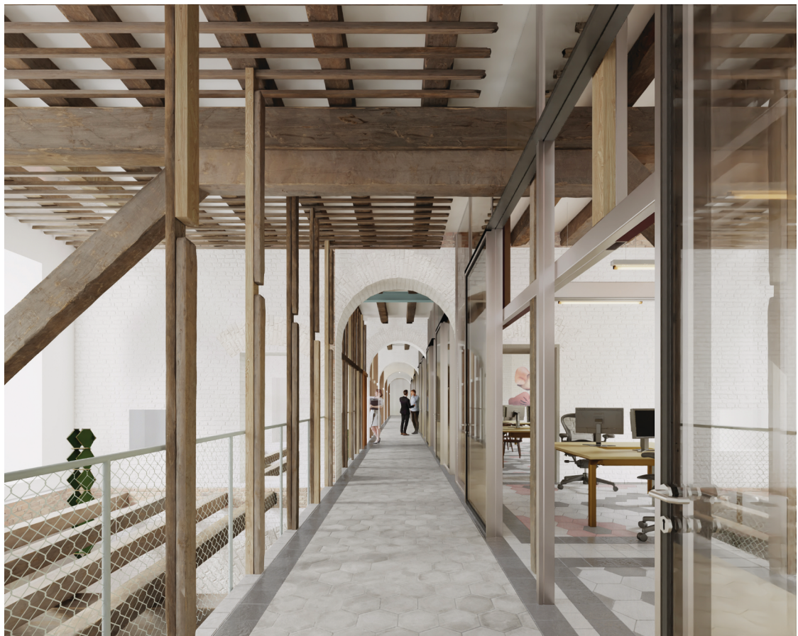
04 – Second floor