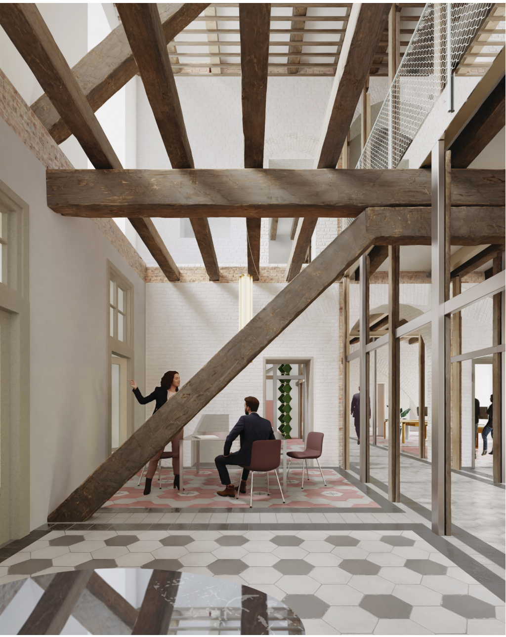
03 – First floor