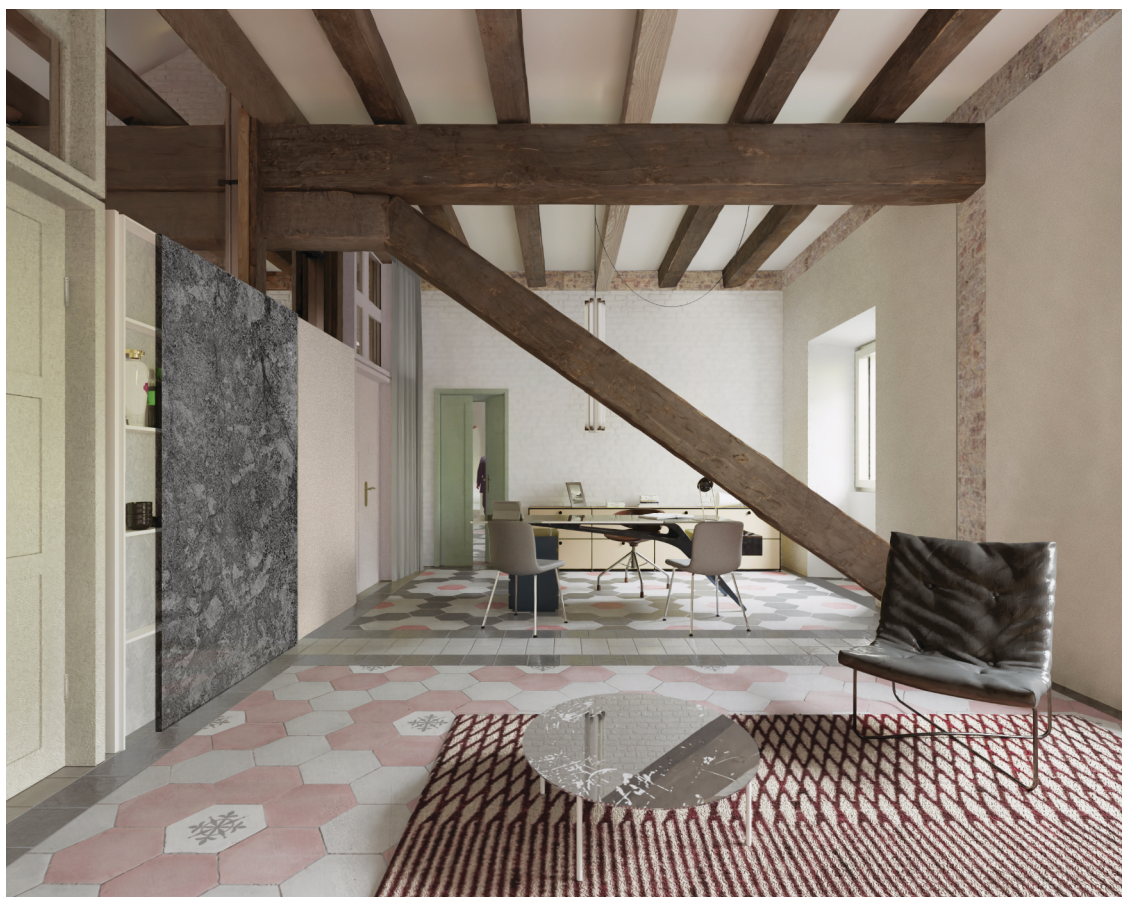
05 – Third floor